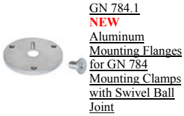
GN 784.1 NEW Aluminum Mounting Flanges for GN 784 Mounting Clamps with Swivel Ball Joint